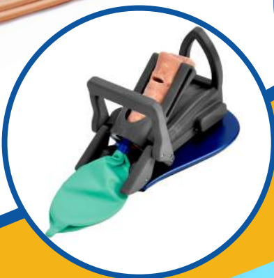
High Fidelity Skin Strips